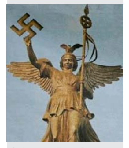
Greek newspaper Eleftheros Typos

in eradicating huge deficits and paying debts. The eurozone policy-makers also demolished a taboo in EU regulations; they allowed the European Central Bank (ECB) to intervene directly in the market by buying EU Government bonds to stabilize their prices and prevent the speculators from gambling on the countries' bank defaults. The Greek public is upset that this rescue mechanism was introduced after it had been forced to accept the harsh EU-IMF ad hoc programme.